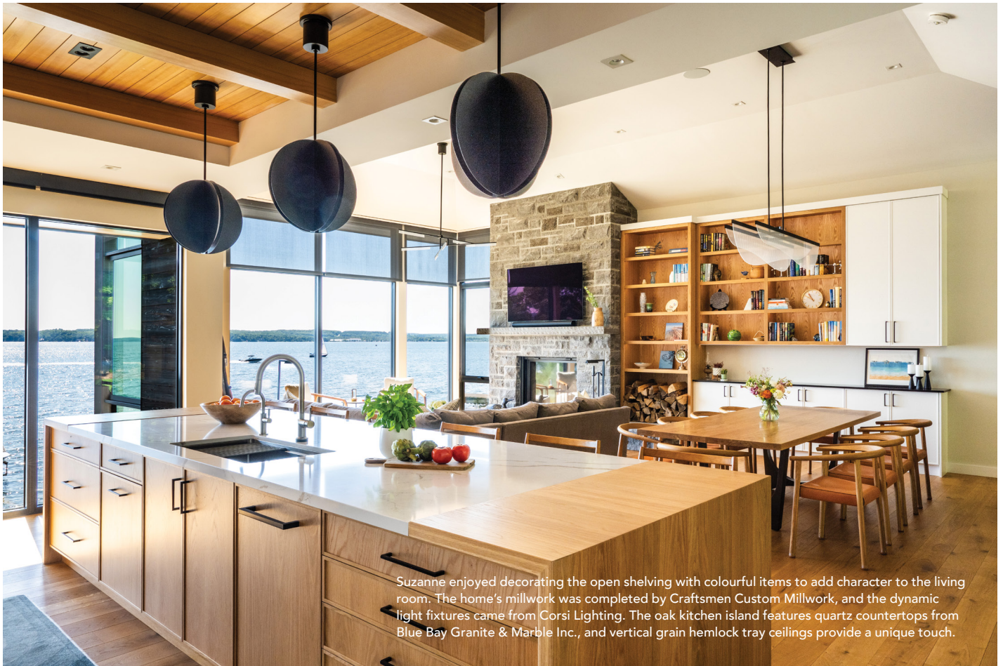
Suzanne enjoyed decorating the open shelving with colourful items to add character to the living room. The home's millwork was completed by Craftsmen Custom Millwork, and the dynamic light fixtures came from Corsi Lighting. The oak kitchen island features quartz countertops from Blue Bay Granite & Marble Inc., and vertical grain hemlock tray ceilings provide a unique touch.