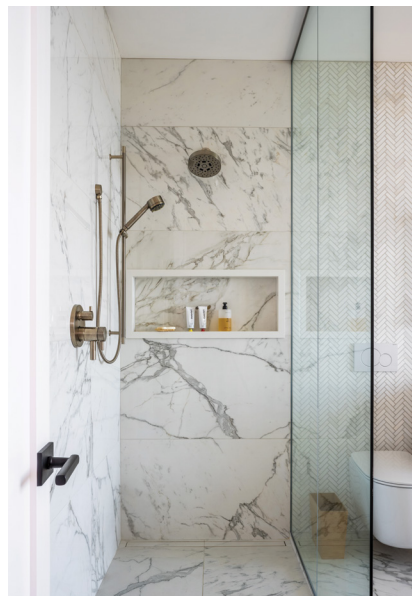
ABOVE: The primary bedroom is the embodiment of luxury. Also painted Benjamin Moore Classic Gray, the space has a private balcony and cozy furniture sourced from Pavilion Modern, West Elm and Crate & Barrel. The 11-foot ceilings feature eastern hemlock. FAR LEFT: The spa-like primary en suite boasts a double vanity created by Craftsmen Custom Millwork and gorgeous tile sourced from Ciot and installed by St. Peter’s Roma Tile Inc. LEFT: The walk-in shower is tile-drenched, creating a bold, immersive look.