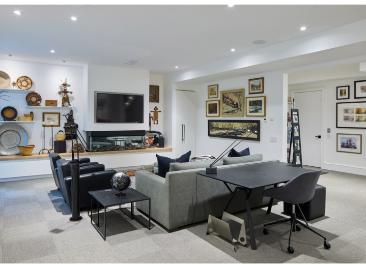
TOP: An open-riser stairway leads to the spacious lower level. ABOVE: The rec room, which showcases the family's art collection, is a comfortable space for enjoying hockey and puzzles. RIGHT: A pop of marigold tile brightens the lowerlevel laundry room.

"Special events and holidays are celebrated at our house," says Marsha, noting how the family's dynamics were important when designing the layout. The couple's grown children and their families live within walking distance, and the grandkids, ages five to 12 are over often. "We wanted everyone to feel comfortable," adds Marsha.